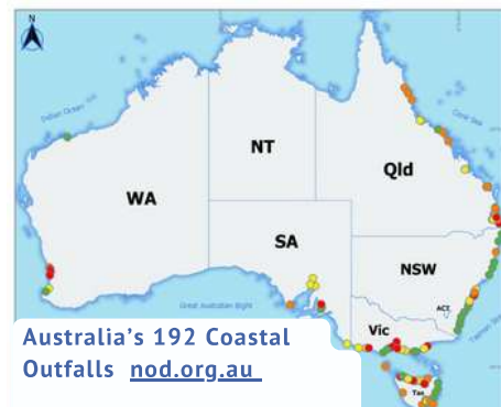
Australia's 192 Coastal Outfalls nod.org.au